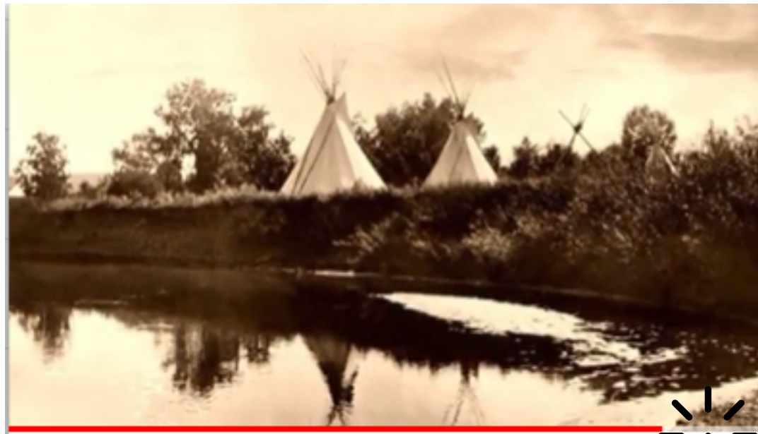
Blackfoot Sky (Acoustic) - Ira Provost