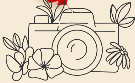
PHOTO RETAKES DAY October 9

Taco In a Bag November 5 (last day to order is Oct 15)